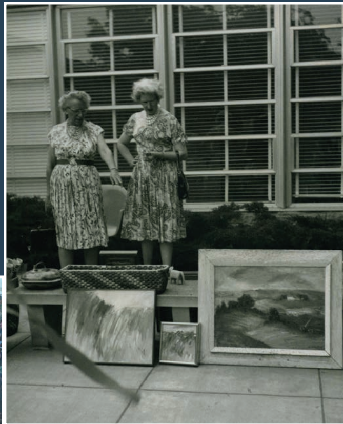
Iowa Artists Exhibition

AFTER 40 YEARS BEHIND THE DES MOINES ART CENTER, THE EVENT MOVED DOWNTOWN IN 1998 AND CHANGED ITS NAME TO DES MOINES ARTS FESTIVAL.