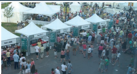
Des Moines Arts Festival, 2007