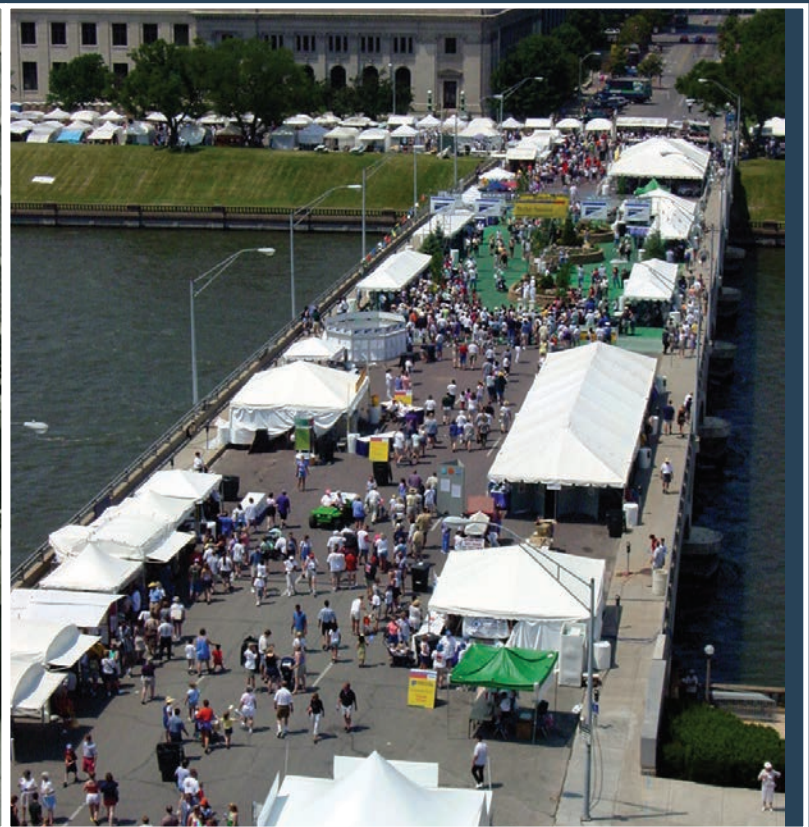
Des Moines Arts Festival, 1998