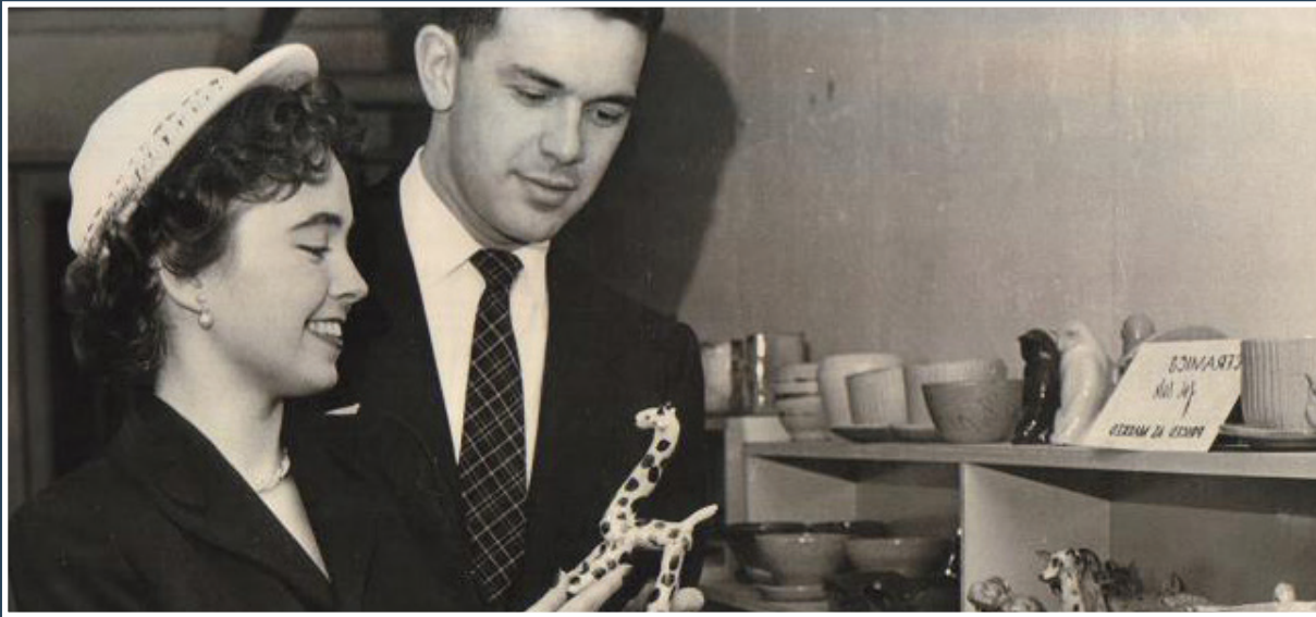
All Iowa Art Fair