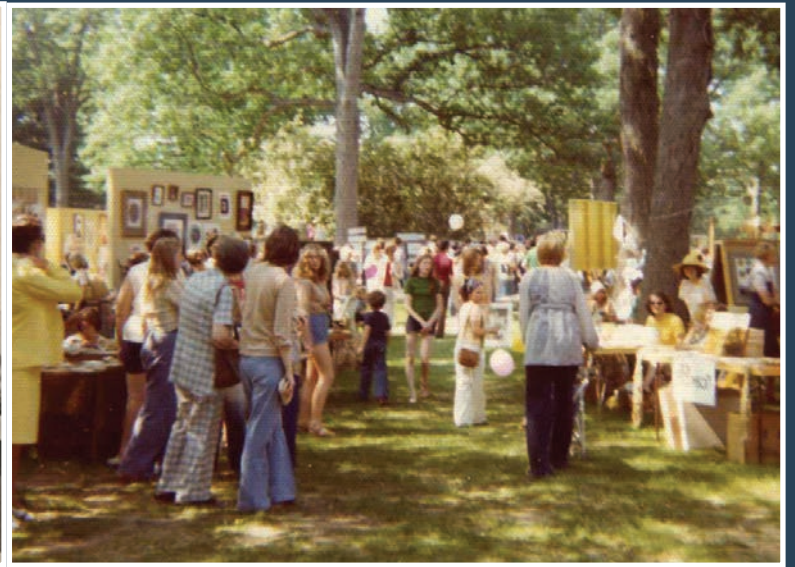
Art in the Park

AFTER 40 YEARS BEHIND THE DES MOINES ART CENTER, THE EVENT MOVED DOWNTOWN IN 1998 AND CHANGED ITS NAME TO DES MOINES ARTS FESTIVAL.